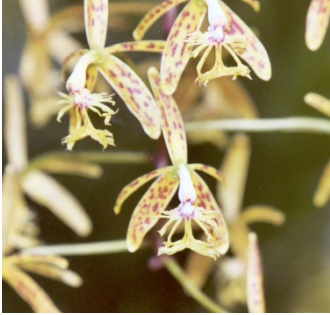
WSO 4761 cristatum ('Crazy Lip' x self) – A weird species from Panama. Grows to just under two feet. 5 Flasks available, 8-9 seedlings per flask, $15 each