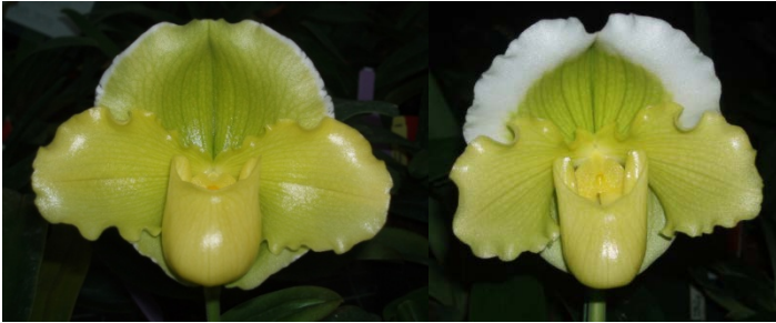
WSO 4753 Elfin Moon ('Hat Creek' x 'Elk Creek') – Strong-growing yellow complex hybrid with great color, fine shape and good size. The parents were selected from seedlings from The Orchid Zone. 3 Flasks available, 8-9 seedlings per flask, $25 each