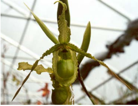
WSO 4954 boisserianum var. reticulatum – Love these, and not often seen in cultivation. 2 flasks available, 8-9 seedlings per flask. $30 each