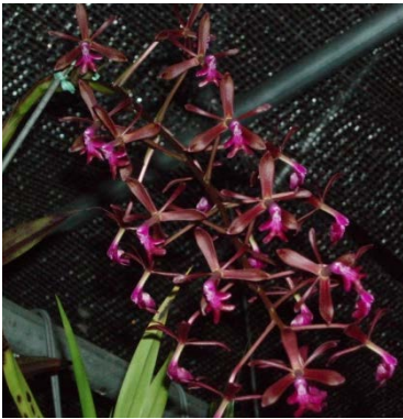
WSO 4768 Penns Creek (melanoporphyreum 'Penns Creek' x cnemidoporum 'Penns Creek' AM/AOS) – Bill has made over 100 Epidendrum crosses and here is a remake of one of the best. A couple of plants from the first make received AOS flower quality awards from the luscious fuchsia color and dramatic presentation. Red-purple foliage. Grow intermediate moderately bright light. Don't miss these! 10 Flasks available, 8-9 seedlings per flask, $30 each