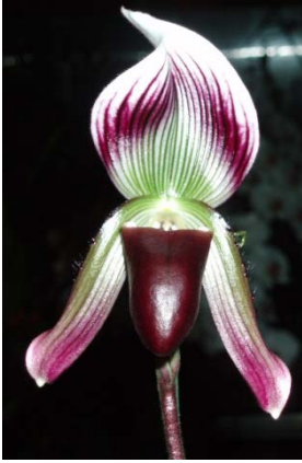
WSO 4526 callosum var. sublaeve ('Miami' x self) (Thailand) - Rare in cultivation. Warm-growing. 2 Flasks available, 8-9 seedlings per flask, $25 each