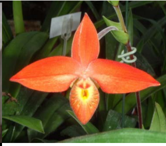
WSO 5157 Sunset Glow (4N) 'Kelly

Creek' HCC/AOS x d'alessandroi – Smokin' hot red-orange flowers on medium-sized plants. Highly branched inflorescences are almost guaranteed! 10 flasks available, 8-9 seedlings per flask. $35 each