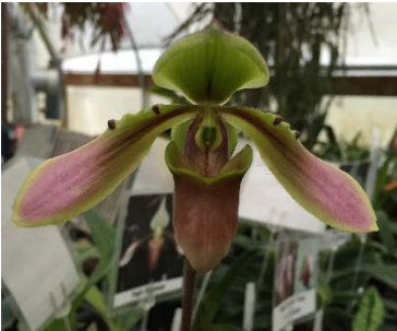
WSO 4783 bullenianum ('Hutchins Pond' x 'Briscoe Pond') – Rare Malaysian species. Beautiful mottled foliage, attractive flowers on tall stems and small plants. 5 Flasks available, 8-9 seedlings per flask, $30 each

WSO 4803 fowliei – Rare now in cultivation, this diminutive Philippine species is probably extinct in the wild. Quickly grows into multigrowth specimens in 4" pots. 15 Flasks available, 8-9 seedlings per flask, $25 each