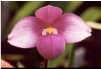
WSO 4949 fischeri ('Big Fishing Creek' x sib) – Truly beautiful and almost never offered. Do not miss these. Strong-growing seedlings. 10 flasks available, 8-9 seedlings per flask. $50 each