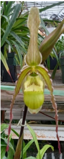
WSO 5009 richteri ('Beachview's Buddy' AM/AOS x sib) – Lovely compact growing Ecuadorean species. Always popular. 5 flasks available, 8-9 seedlings per flask. $25 each