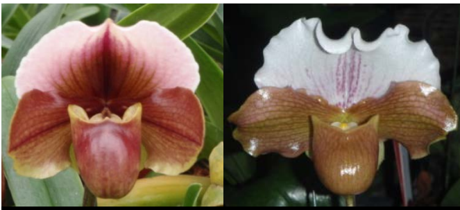
WSO 4398 Sierra Sunrise 'Woodstream' FCC/AOS x Little Stevie 'Penns Creek' - Dream cross between the spectacular Sierra Sunrise and Harold Koopowitz's miniature wonder Little Stevie. We would love to bloom them all, but we have enough to share. These will be very compact plants with complex Paph form and red-pink coloration. 1 flask available, 8-9 seedlings per compot, $30 each