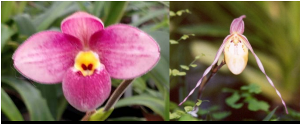
WSO 5000 Spot On 'Weitas Creek' x klotzscheanum 'Weitas Creek' – We chose this miniature cross to be our 5,000 th cross! Should be smaller than Spot On with charming colorful flowers ranging from plum through rose-pink. May have a few with yellow pouches. Don't miss these!! Easy! Fast-growing. 4 flasks available, 8-9 seedlings per flask. $35 each