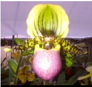
WSO 4549 victoria-reginae (syn. chamberlainianum) var. latifolium 'Savage River' AM/AOS x self (Indonesia) - Wonderful sequential blooming species that can be in bloom for years. Everyone who sees our plants at shows want one (or two)! 7 Flasks available, 8-9 seedlings per flask, $25 each