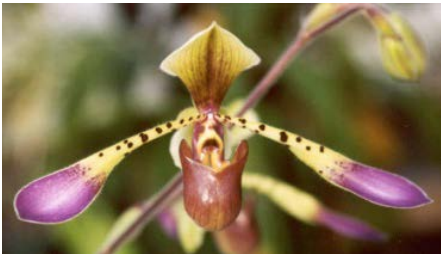
WSO 4574 lowii ('Poe Valley' x self) (Malaysia) - Vigorous selfing of a good quality cultivar. 1 flask available, 8-9 seedlings/flask $35 each