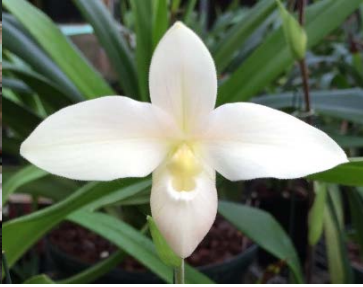
WSO 5072 richteri 'Beachview's Buddy'

AM/AOS x Saint Ouen 'Ice Queen' JC/AOS – Should be very similar to an excellent white/pinkish-white cross Polar Shift (pearcei x Silver Eagle) 8 flasks available, 8-9 seedlings per flask. $35 each