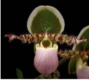
WSO 4751 liemianum ('Kelly Creek' AM/AOS x 'Penns Creek' AM/AOS) - (Sumatra) Sequential blooming. Easy and popular! Superior parents. Very limited. 10 Flasks available, 8-9 seedlings per flask, $30 each