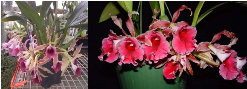
WSO 4497 coccinea

'Penns Creek' x crispa 'Quake Lake' - A red floriferous primary hybrid that should have large showy flowers and not hard to grow or bloom. 4 Flasks available, 8-9 seedlings per flask, $15 each