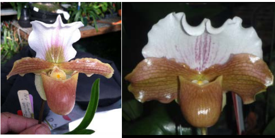
WSO 4809 Barbie's Candy 'Poe Creek' x Little Stevie 'Penns Creek' - Barbie's Candy is (Coconut Candy x barbigerum album), a true miniature cross from the breeding of Harold koopwitz. Harold's Little Stevie is a magnificent charlesworthii

WSO 4803 fowliei – Rare now in cultivation, this diminutive Philippine species is probably extinct in the wild. Quickly grows into multigrowth specimens in 4" pots. 15 Flasks available, 8-9 seedlings per flask, $25 each