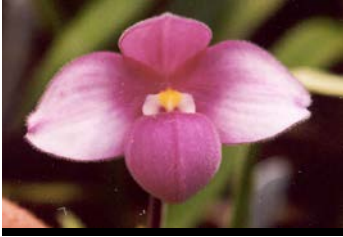
WSO 4876 fischeri ('Joan' AM/AOS x self) – Truly beautiful and almost never offered. Do not miss these. Strong-growing seedlings. 10 flasks available, 8-9 seedlings per flask. $50 each